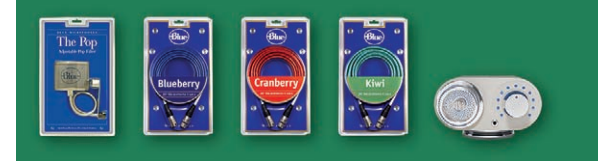
L-R: The Pop ; Blueberry , Cranberry , & Kiwi cables; Robbie the Mic Pre

To get the most out of this, or any quality microphone, it is essential to pair it with a good microphone preamplifier. Most professional recordists prefer to have out-board preamps on hand, and will choose solid-state or vacuum tube models based on their unique characteristics. To maintain the integrity of your signal, try using Blue's Cranberry, Blueberry or Kiwi high-definition mic cable along with Blue's outstanding Class-A vacuum tube mic preamp, Robbie. And, whenever possible, connect your pre's output directly to your recorder or A/D converter, bypassing the mixing board and any unnecessary components.