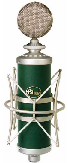
Kiwi shown with The Shock

You will notice that the sound of the Kiwi capsule changes when adjustments are made to the nine-position pickup pattern switch on the microphone body. In general, the omnidirectional pattern offers the flattest frequency response, with an absence of proximity effect. As the pattern becomes more directional (by clicking clockwise through the